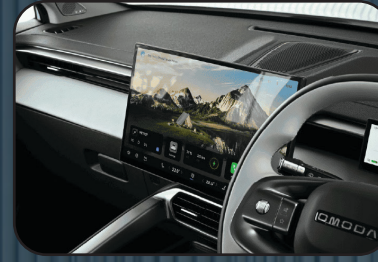
15.6" Widescreen Display