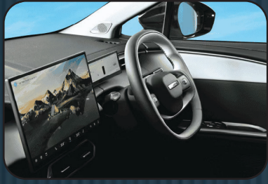
Camping Mode for Private Relaxation Space