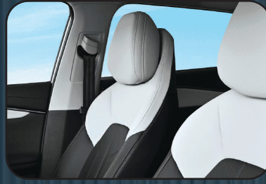
Sport Seat with Driver Massage Function