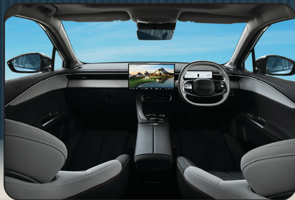
Wide Space Cabin