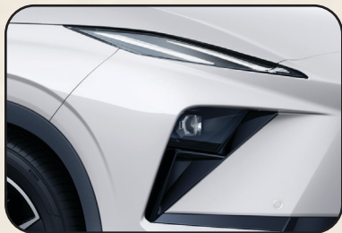
Crystal Edge Daytime Running Lights