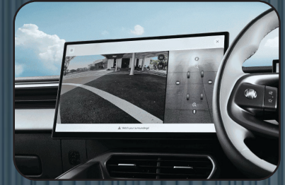
540° Surround-View Camera