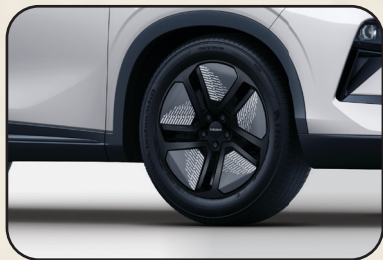
Sporty 18" Alloy Wheel