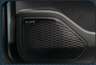
8 Sony Speakers