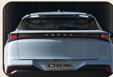
Phantom Wing Taillights