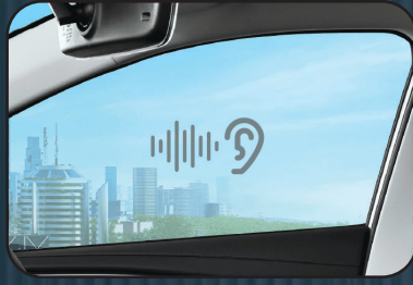
Front Dual-layer Windows with Noise Reduction