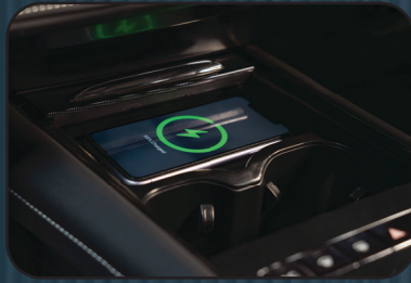
50W Wireless Phone Charger