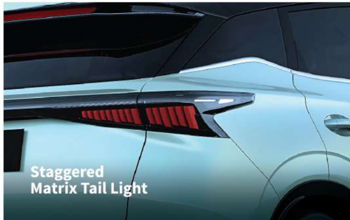
Staggered Matrix Tail Light