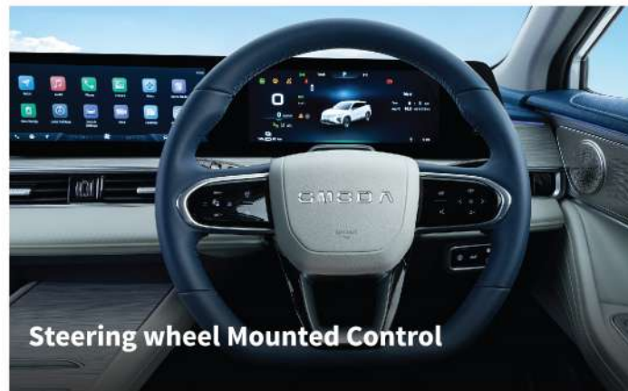
Steering wheel Mounted Control