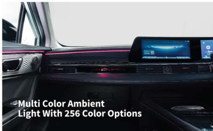
Multi Color Ambient Light With 256 Color Options