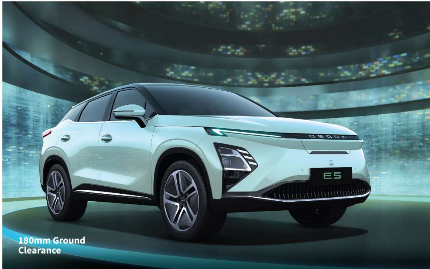
180mm Ground Clearance