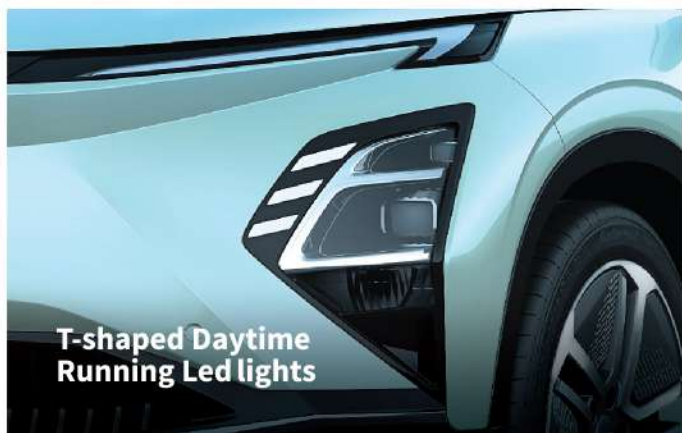
T-shaped Daytime Running Led lights