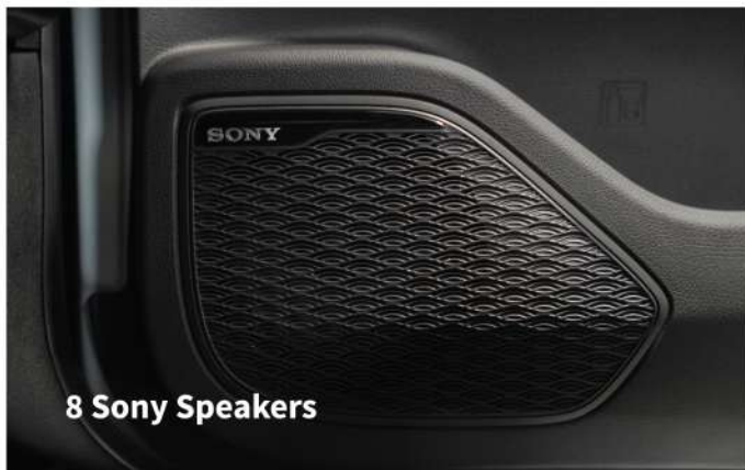
8 Sony Speakers