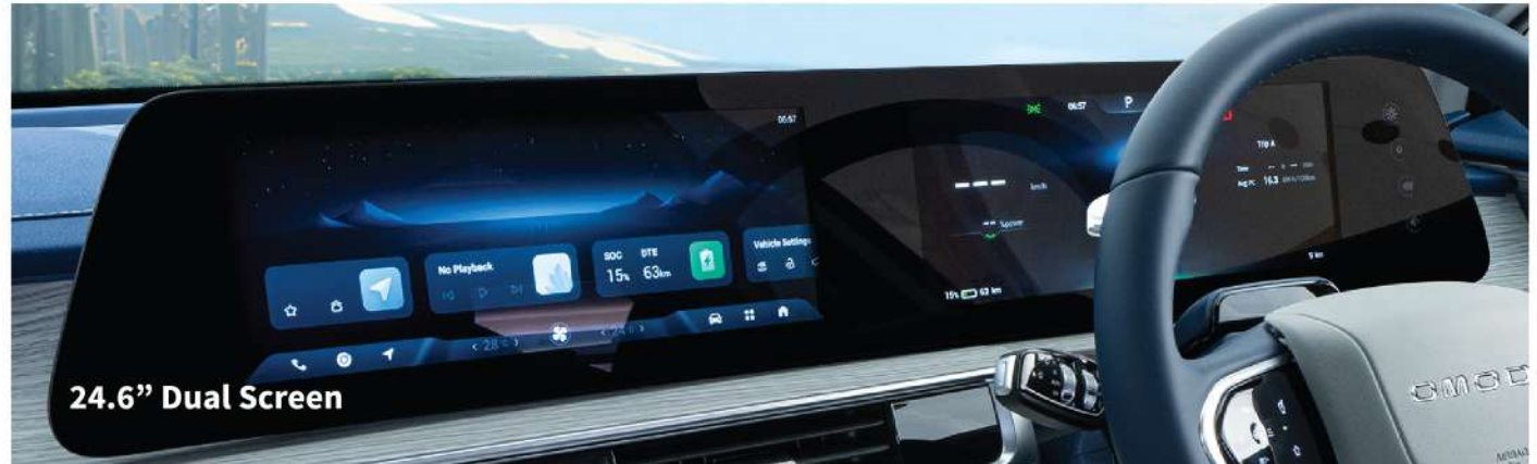
24.6" Dual Screen