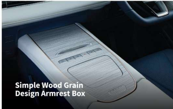
Simple Wood Grain Design Armrest Box