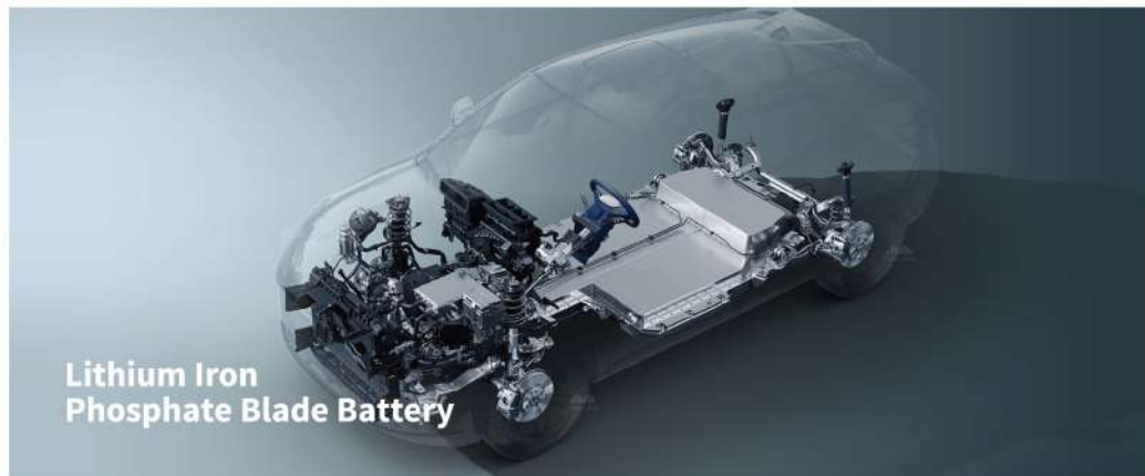
Lithium Iron Phosphate Blade Battery